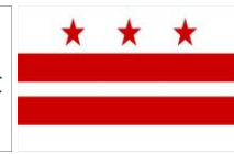
DISTRICT OF COLUMBIA